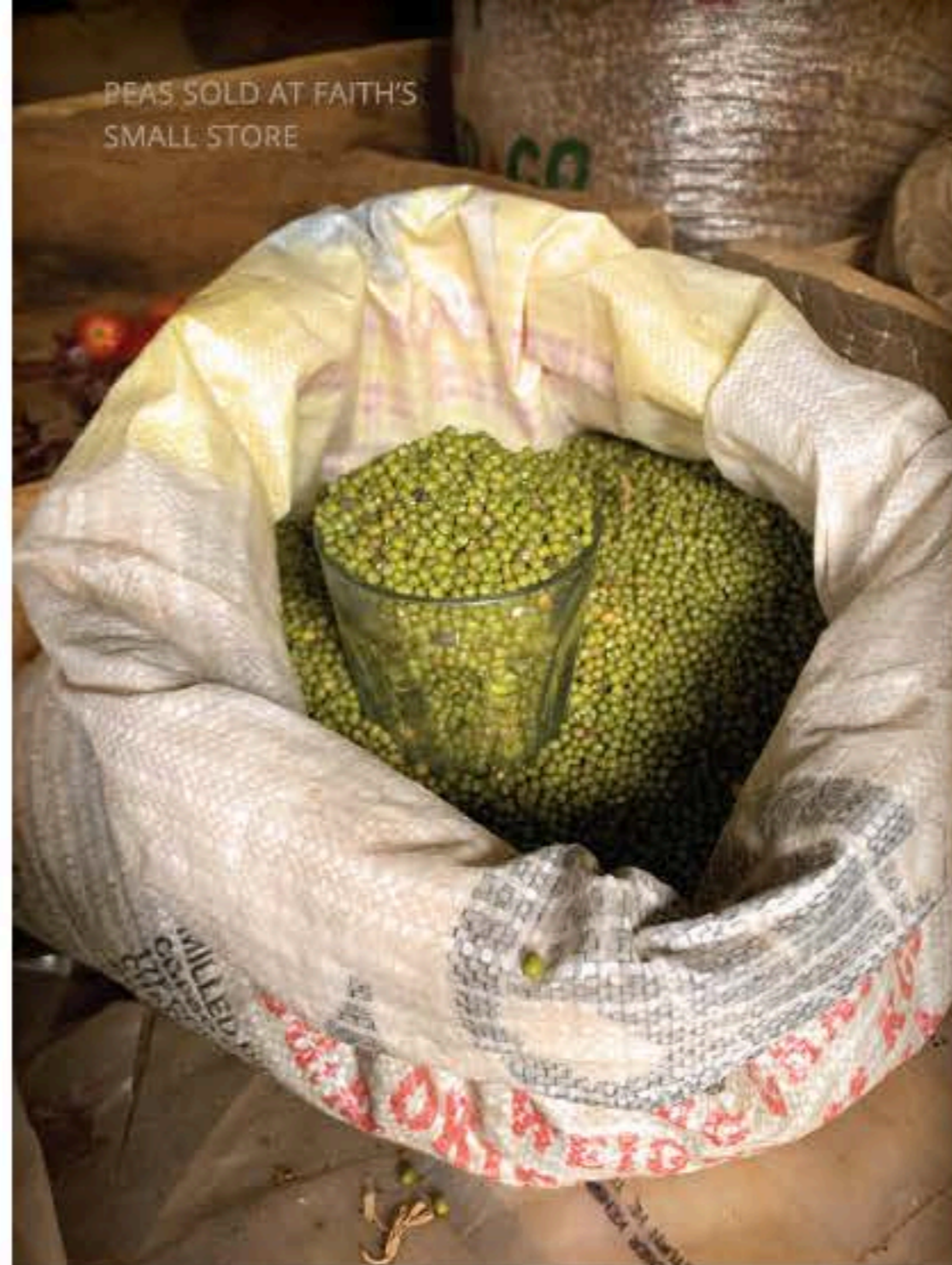
PEAS SOLD AT FAITH'S SMALL STORE