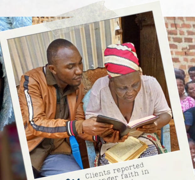
63% Clients reported stronger faith in Jesus Christ