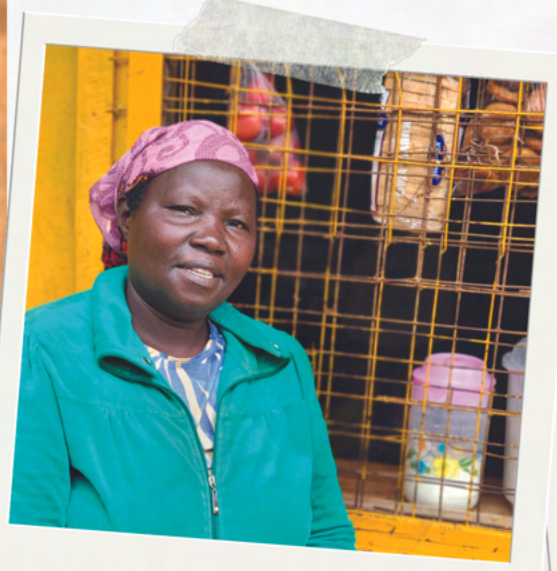
1,377 Microloans provided in 2022 (+12% from '21)