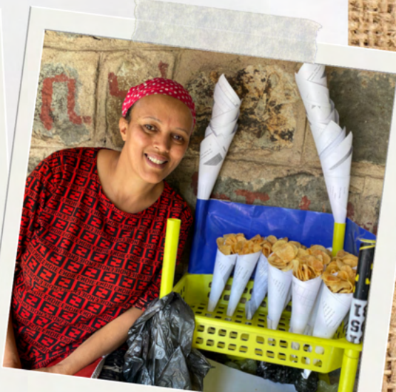
5,412 Total loans granted over TOLI's history