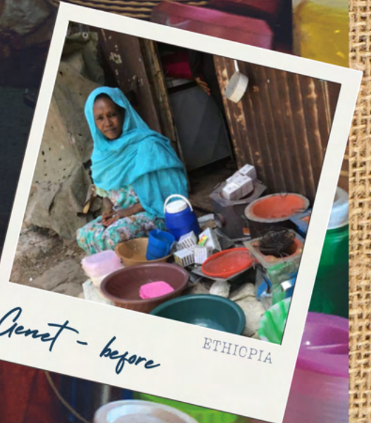
Aenet - before