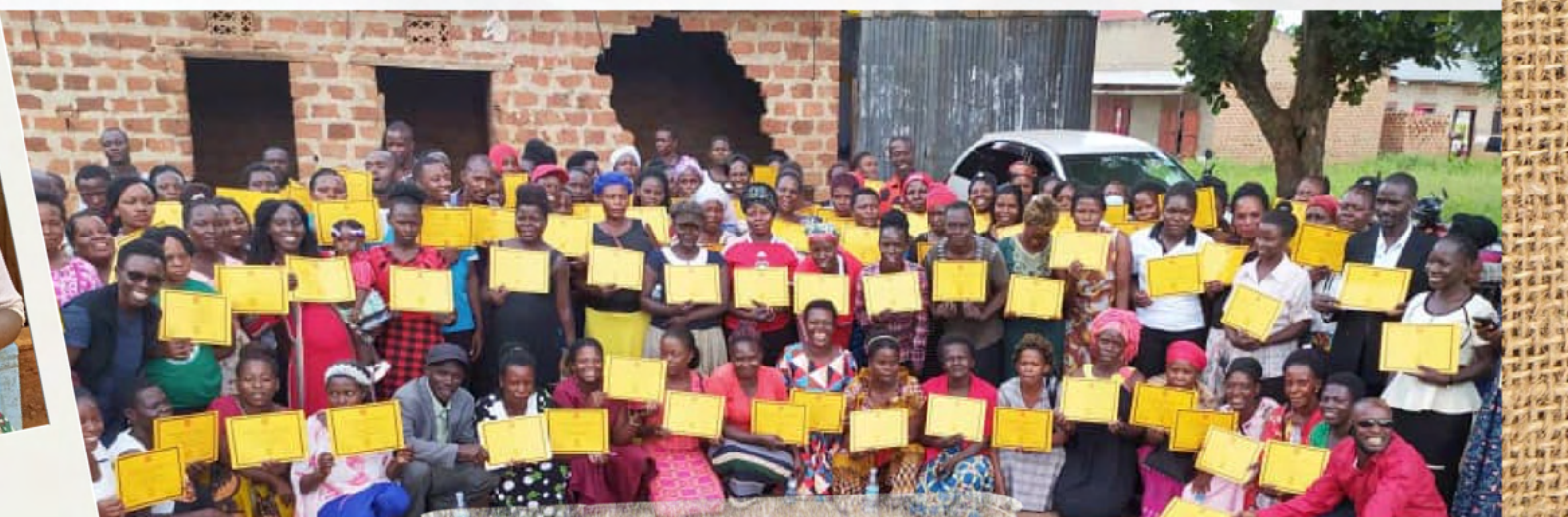
1,866 Business training participants (+44% from '21)