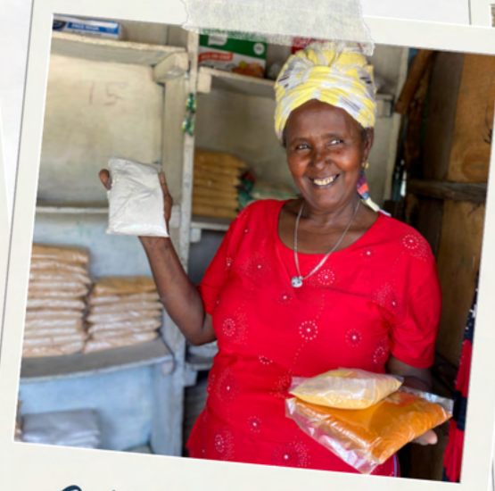
2,856 Total entrepreneurs served in 2022 through training and microloans