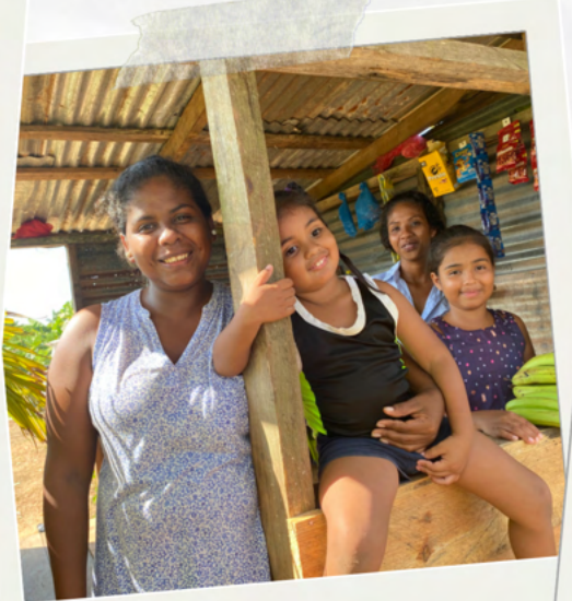
$264 Average microloan value