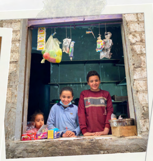
13,467 Total reach in '22, including family members (+48% from '21)